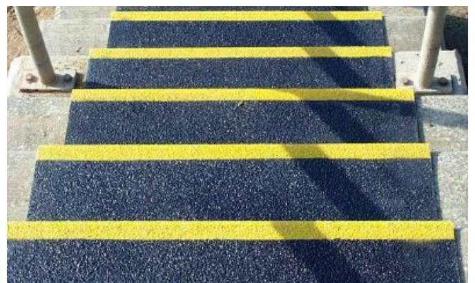
Stair Tread Covers